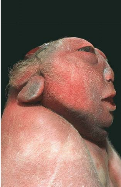
Figure1 . Anencephalic Infant.

Note that the clinical presentation is so obvious that advanced imaging modalities like MR imaging should not usually be necessary to establish the diagnosis. In particular, note the absence of a fetal cranial vault. Anencephaly is a particularly common congenital malformation--about 0.1 percent of live births.